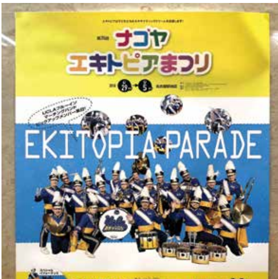
Poster in Nagoya mall