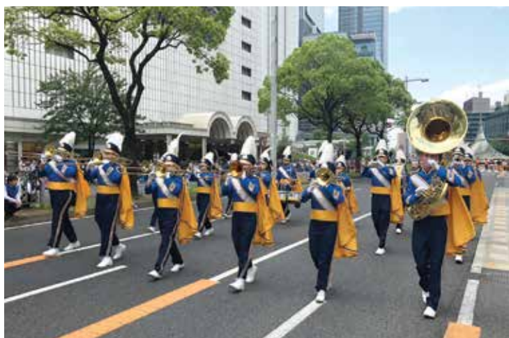
Ekitopia Festival Parade in downtown Nagoya