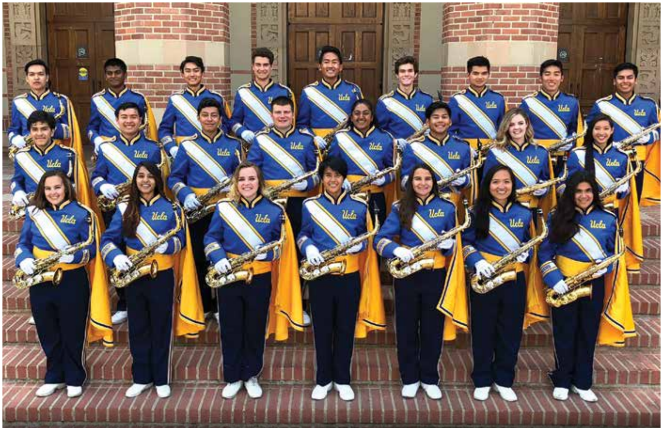
The Alto Saxophone Section Fall 2017