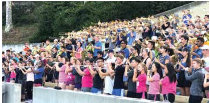
Band Camp Rehearsal in Drake Stadium