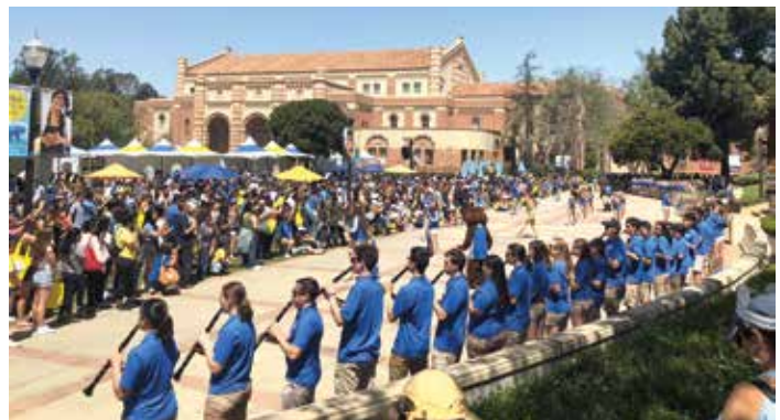
Bruin Day April 2018