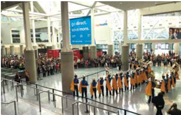
Gig at the Los Angeles Convention Center