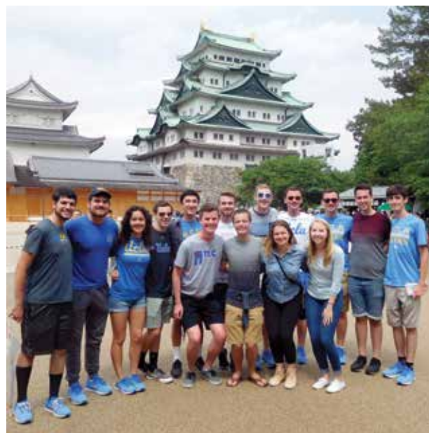
Visiting Nagoya Castle that was first built in 1620

The Band arrived in Nagoya on May 2 and rehearsed on May 3 in preparation for the performance. On May 6, the Band traveled to Kyoto to visit several historical sites including Kinkaku-ji (The Golden Temple), the Arashiyama Bamboo Grove, the monkeys at Kameyama-koen Park, and the ancient gates and shrines at Fushimi Inari-taisha. The Band arrived back to Los Angeles on the morning of May 7, and most of the students headed directly to classes.