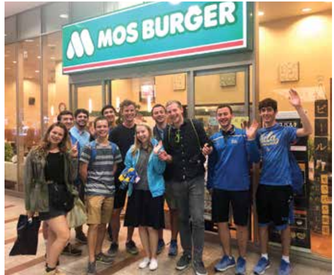
Late night trip to Mos Burger