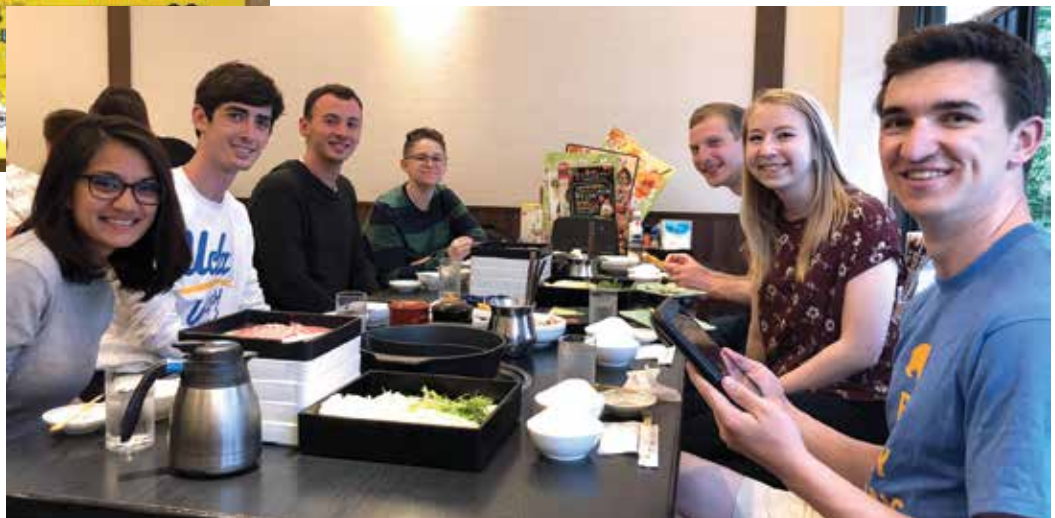
Shabu Shabu dinner in Nagoya