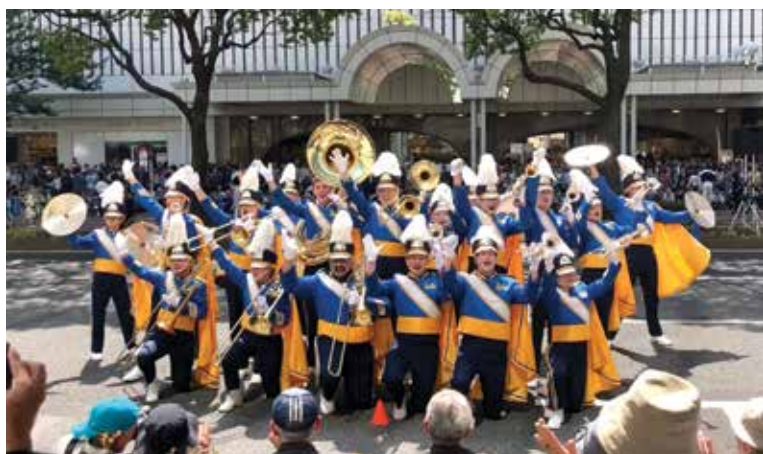
The end of the Ekitopia Parade Performance